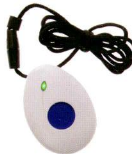
Fall Detection Pendant